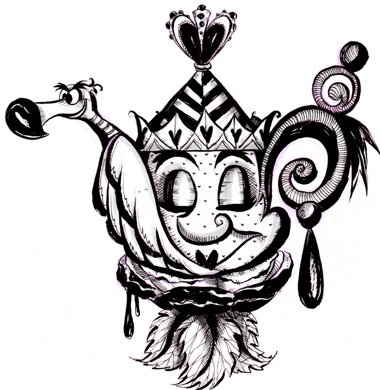
queen of hearts teapot

Queen of Hearts teapot - lightly sketched out in Pink ColorEno mechanical pencil and inked with Pentel Pigment brush pen/ Muji gel ink pen.