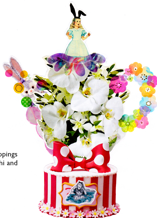
alice in the garden teapot

Alice in the Garden teapot collaged with clippings from a Japanese "Disney Fan" magazine, washi and regular stickers.