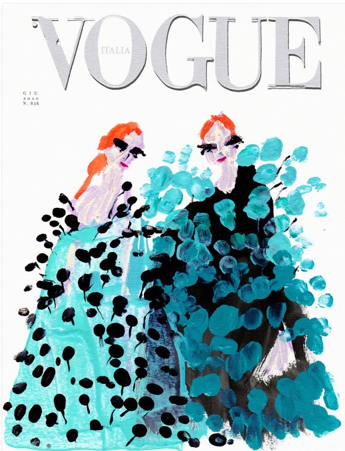
givenchy f/w haute couture 2019