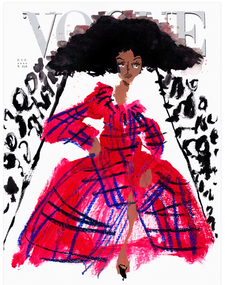
christopher john rogers f/w 2020