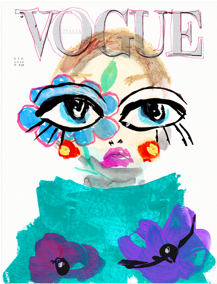
twiggy by richard avedon 1967