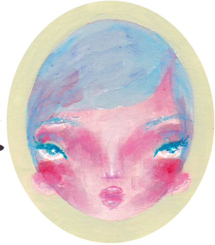
ACRYLIC PAINT + WATER SOLUBLE CRAYONS