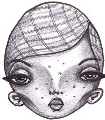
GEL PENS + GRAPHITE PENCILS

1122-102 1122-103 1122-169 1122-180 1122-191