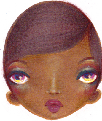
ALCOHOL MARKERS + PASTEL PENCILS

083 ultramarine pink 171 turquoise blue 112 manganese violet