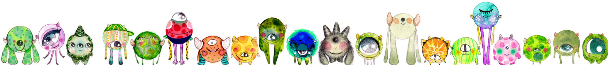
extra detail and texture for the 2nd and 3rd row of Wazowskis