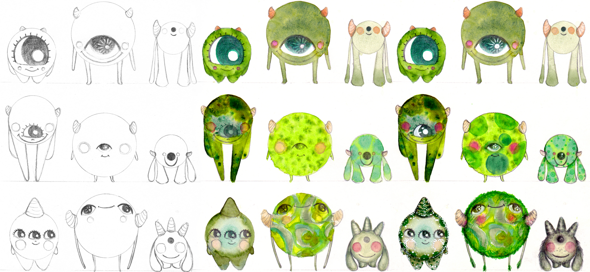
the sketches, deriving a new Wazowski from the one above

STEP 5 - RINSE AND REPEAT. AS I CONTINUE TO MAKE DERIVATIVES I ALLOW MY RULES TO BECOME LOOSER AND LEAN FURTHER INTO MY CREATIVE FRENZIES FOR WILDER RESULTS