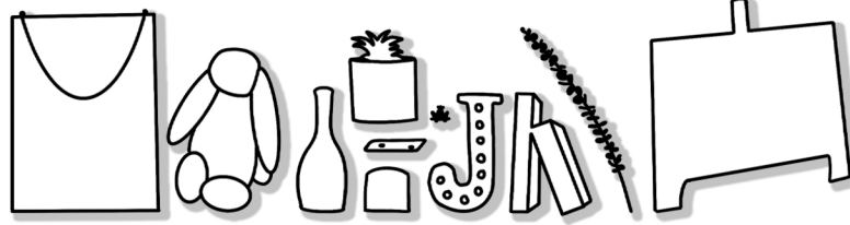
simplified sketches of objects from the shelf